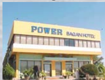
Bagan Power Hotel